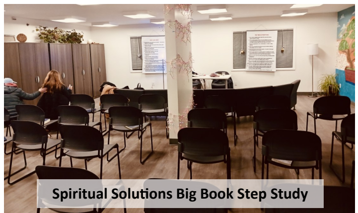
Spiritual Solutions Big Book Step Study