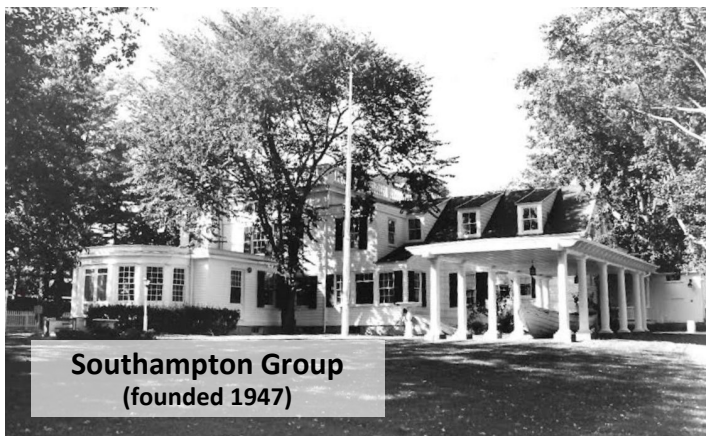
Southampton Group (founded 1947)