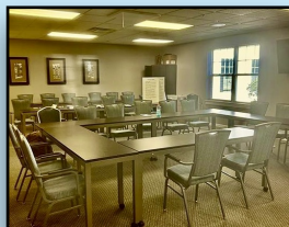
Never too Late

Both will be missed so much. Our thoughts are with their loved ones