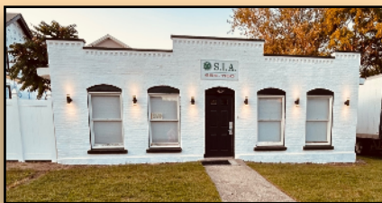
SIA Office Patchogue

November has traditionally been the month of gratitude. A perfect time to throw an extra buck or two or ten into the basket. Maybe this will spur you on to send that monetary gift to AA World Services. A dollar for every year you are sober could be a good starting point. Remember: this program did save your life