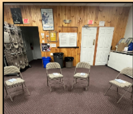
12 X 12 in St. James

Isn't that the essence of Alcoholics Anonymous? Aloha.