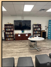
Island of Enthusiasm Meeting Room