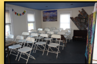
Organic Mustard Seed