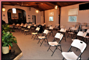
Byron Lake Group