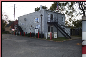
St. James Sunrise Reflections

I didn't come to AA because I saw the light. I came because I felt the heat