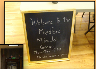
Medford Miracle Group