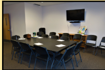
Sober Just for Today East Setauket

Sober Just For Today has moved back to Setauket. It now meets at St. James on Route 25A. Same days and times (Tuesday and Friday at 10:00 AM)