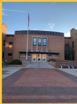
St. Joseph's College

Group anniversaries: Smithtown St. Pats and in November, Kings Park Just for